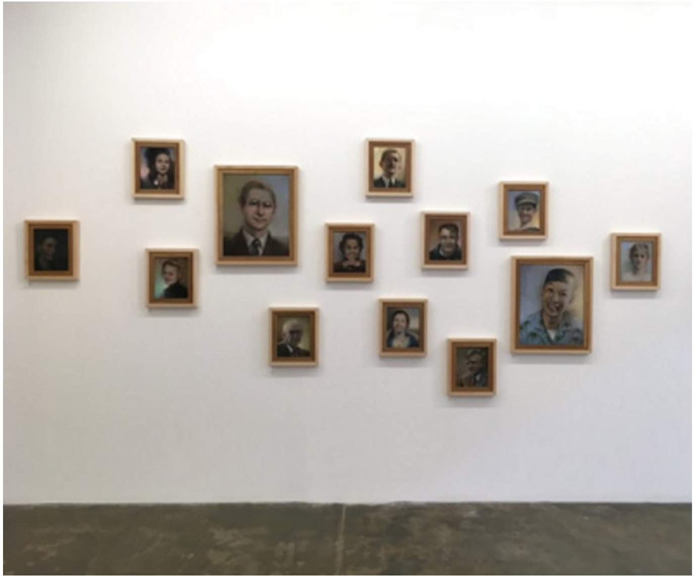
Daryl Austin, Installation view, Fictions 2016, GAGprojects

Another evolution is the way these works are displayed. In the exhibition in 2013 the paintings were displayed in a continuous line around the gallery, however, in this latest exhibition they are staggered in groupings – reminiscent of how people might hang family photographs in the home.